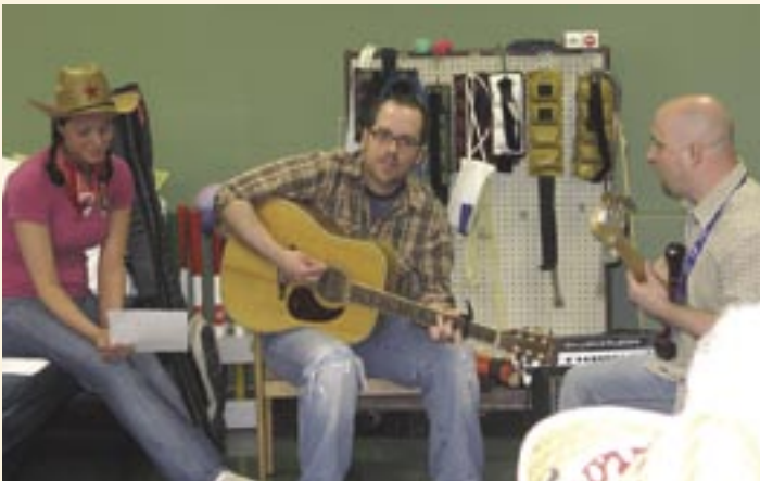
Left: The therapy staff played guitar and stomped their feet as they joined in western activities.