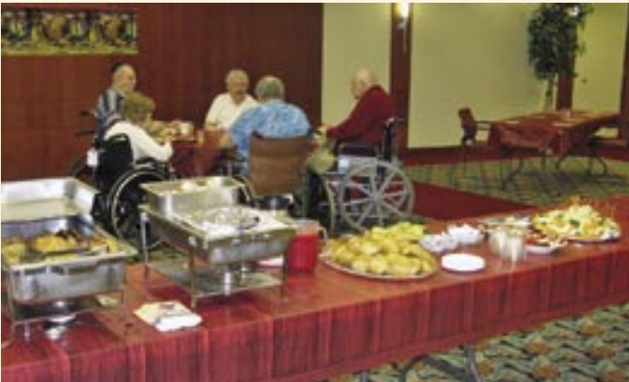
The Cattleman’s breakfast featured a buffet table of vittles that would satisfy any cowpoke’s hearty appetite.