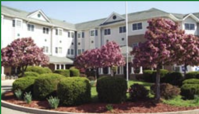
Elan Gardens in full bloom.