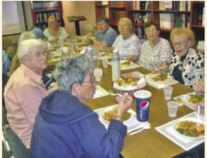
Above: Pasta lunch at the JRC.