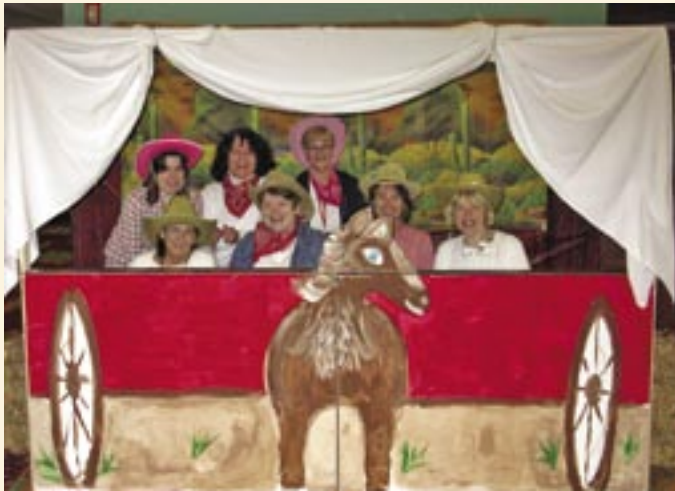
The business office staff enjoys a ride in our homemade wagon constructed by Jewish Home staff and residents especially for this "down home week".