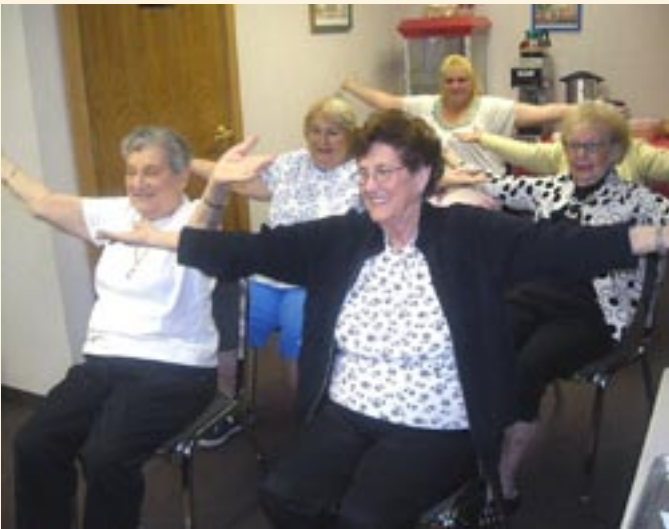
Above and below: JRC seniors participating in an exercise class and chair aerobics.